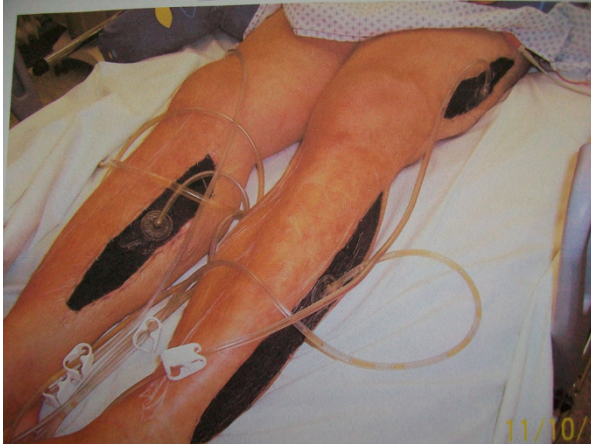
Figure 1 Compartment syndrome of both lower legs and both thighs secondary to Systemic Capillary Leak Syndrome (SCLS). Decompressive fasciotomy

mmol/L). Parameters of cholestasis and aminotransferases were not altered (bilirubin 0.7 mg/dL, alkaline phosphatase 66 U/L, gamma-glutamyl transferase 60 U/L, aspartate aminotransferase 32 U/L and alanine aminotransferase 39 U/L). Arterial blood-gas analysis showed the following: pH 7.06, pCO 2 43 mmHg, pO 2 91 mmHg, bicarbonate 11.9 mmol/L, anion gap 11.6 mmo/L. Creatine kinase was normal (124 U/L) on hospital day 1 and rose to over 7000 U/L on day 2 (day of admission to our ICU).