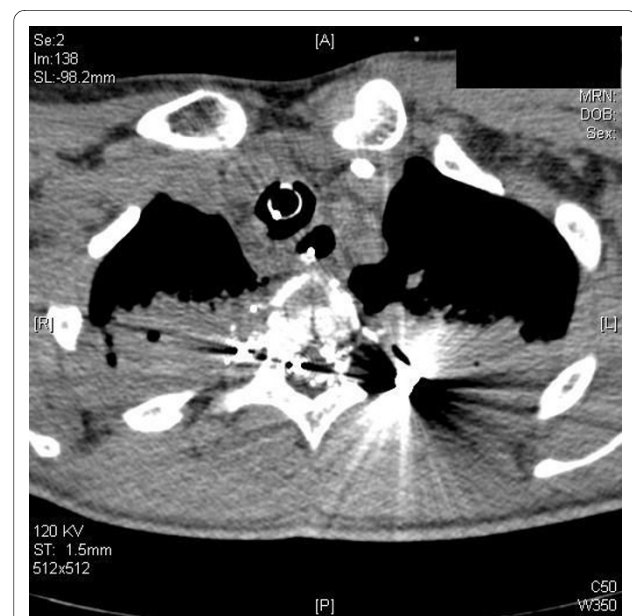
Figure 4 CT-scan: Spinal gunshot with destruction of the spinal cord. These injury caused a complete paraplegia and an unstable fracture of the vertebra.

The operative therapy of spinal gunshot injuries belongs in the second phase. Many patients could be