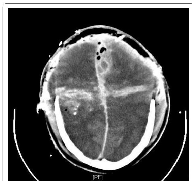
Figure 2 CT-scan of a lethal gunshot injury of the brain with massive swelling and increased pressure despite of craniotomie. The patient died despite of immediate craniotomie.

CT diagnostics often allow the delineation of the precise injuries and can determine the need for therapeutic interventions or the need for further diagnostics. CT-scans can show the trajectory of mediastinal injuries in 75% [38] and if mediastinal injuries are assumed the CT scan should be completed with additionally angiography, esophagoscopy, barium swallow, and bronchoscopy [39]. Thoracoscopy has gained wider acceptance since it is more sensitive for small diaphragmatic lesions as compared to CT-scans and it easily allows diaphragmatic repair in hemodynamic stable patients [40,41].