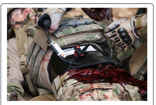
Fig. 3 AAJT<sup>™</sup>.

The Abdominal Aortic and Junctional Tourniquet<sup>™</sup>, formerly known as Abdominal Aortic Tourniquet<sup>™</sup>, can be used in several ways. We previously mentioned the use of the AAJT<sup>™</sup> in axillary bleeding. The AAJT<sup>™</sup> can also be placed over the groin and has a truncal application compressing the distal aorta in the infra-renal zone at the umbilical region. In this way, bilaterally arterial blood