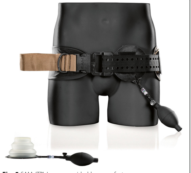
Fig. 5 SAM-JT<sup>™</sup>.

Kragh et al. compared the four junctional tourniquets in a simulated out-of-hospital situation by army medics. Unfortunately, at the time of the study, the AAJT<sup>™</sup> was only FDA-cleared for truncal application. U.S. armed forces medics preferred the CRoC<sup>™</sup> and SAM-JT<sup>™</sup> over the JETT<sup>™</sup> and (truncal) AAJT<sup>™</sup> if they could bring one device on a mission, after testing the various designs at each other [43]. Kotwal et al. reported feedback from battlefield use. The AAJT<sup>™</sup> was reported "to be easily broken" and the CRoC<sup>™</sup> as "bulky, heavy and takes too