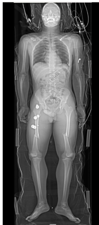
Figure 2 Whole-body scan of a trauma patient with bilateral femur fractures.

In a clinical trial with the LS, Boffard et al compared its effectiveness in detecting injuries with the standard ATLS X-ray protocol [8]. Compared to conventional a.p. radiographs, the authors reported no loss of information for the chest and pelvis, cervical spine, the cervicothoracic junction, or for long bones (Fig. 2). A study by Beningfield