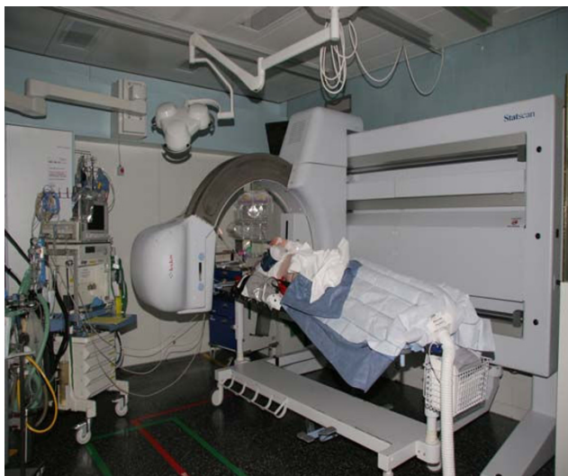
Figure 1 Lodox Statscan device in Inselspital ED.

LS has also emerged as a useful diagnostic tool in other areas of medicine: recent publications have reported on the effective use of the device in pediatric trauma, pediatrics, neurosurgery, internal medicine, and even in forensic medicine. To the best of our knowledge, this is the only FDA-approved device of its kind currently used in emergency departments. A new full body low dosage 2D/3D scanner (EOS http://www.biospacemed.com ) has been recently introduced to the international market, but does not seem to be applicable in injured patients.