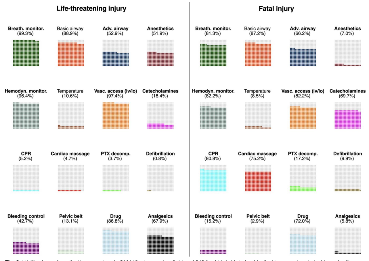
Fig. 2 Waffle chart of medical interventions in 5191 life-threatening (left) and 343 fatal (right) injuries. Medical interventions in bold are significant (<0.001) between the groups. Abbreviations: adv., advanced; breath., breathing; CPR, cardiopulmonary resuscitation; decomp., decompression; monitor., monitoring, PTX, pneumothorax, vasc., vascular

In total, 17.2% of the forgotten cohort received some form of pneumothorax decompression compared to 3.7% in the life-threatening group. In the forgotten cohort, measures for bleeding control were performed in 15.2% and a pelvic belt was used in 2.9%. Both interventions were more frequent in patients with life-threatening injuries (bleeding control in 42.7% and use of pelvic belt in 13.1%).